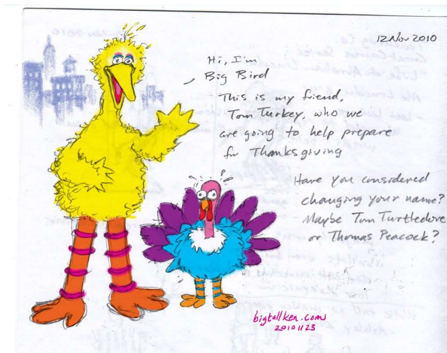
Big bird cartoon by Ken Eaton

The family of the big walking birds, like the Moas (extinct), Nandus, Emus, Ostriches, Elephant Birds ( Aepyornis maximus , extinct). They tend to be seen only in regards to their being different than the “typical” flying birds, and their size is often highlighted as if they had something absurd about them.